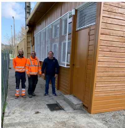
Facelift for the Club House and Football locker rooms