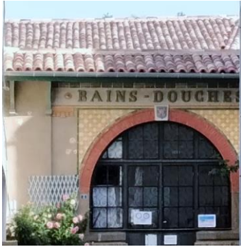
A completely new roof for the library