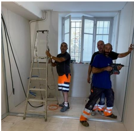
Doctor's Office Reception office into