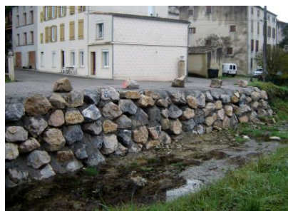
Banks of the Chalabreil