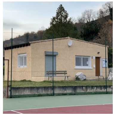
Renovation of the Tennis Club House