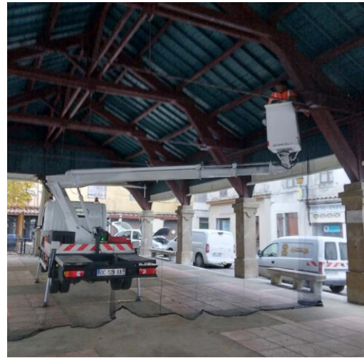
Installation of an anti-pigeon net under the hall