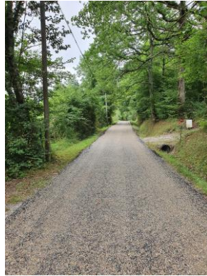
After the bad weather, rehabilitation of the Bourdil road