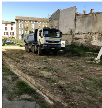
A new car park next to the library